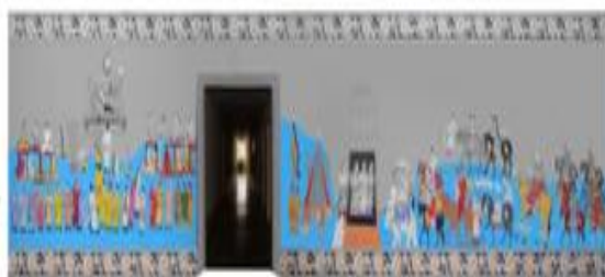
а) сакталий қолвин қисми б) тилқонан қисми