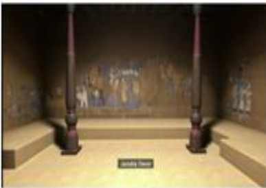
Pic.1. The Scenes south and west wall of the throne common-room in Afrasiab. 3D geographical card of the guests and ambassadors visited to Varhuman.