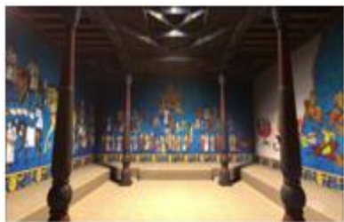
Pic.2. The General type of the interior foyer 2 floors of the institute to Archaeology AN RUZ in Samarkand. 2015