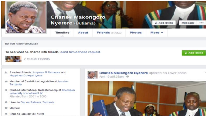
Figure 1 Facebook page of EALA MP Charles Nyerere Makongoro

Additionally, the data collected from respondents also revealed that the 15 respondents 100% were subscribed to a good number of SNSs which were used for a number of reasons. Among which was communication with constituents, friends and family and also posting or uploading articles and other links to various foras of information for citizens.