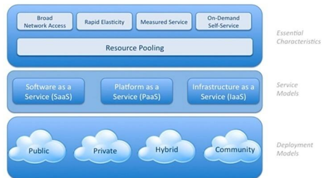
Figure 1: cloud computing architecture

Cloud computing is growing in the real time environment and the information about the cloud and the services it provide and its deployment models are discussed. Figure 1 illustrating the three basic service layers that constitute the cloud computing. It provides three basic services that are Software as a Service, Platform as a Service and Infrastructure as a Service [2]. The rest of the paper is organized as follows. In section 2 we discussed virtualization of cloud. In section 3, load balancing