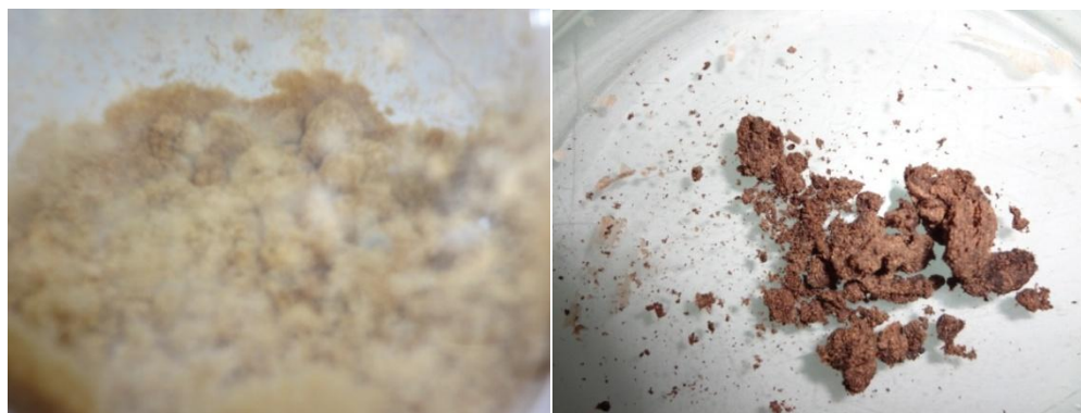
a). before delignification