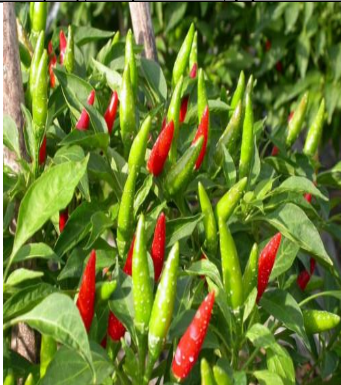
Figure2. hot chili paper plants [56]