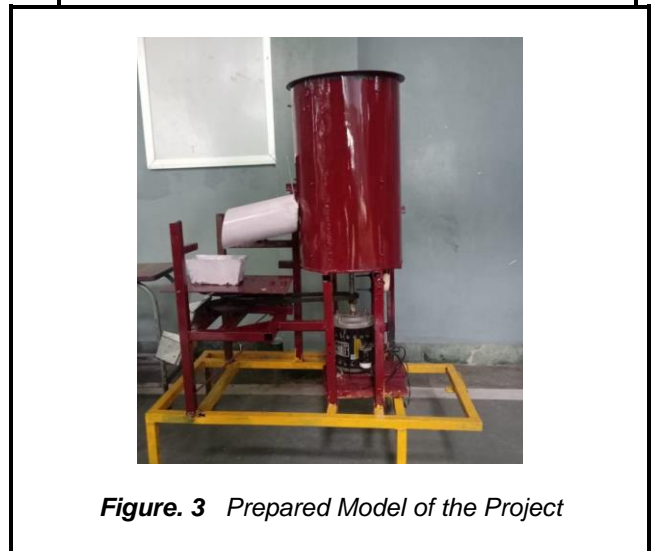
Figure. 3 Prepared Model of the Project