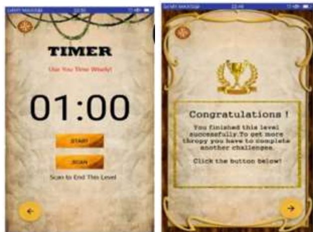
(a) Timer (b) Trophy