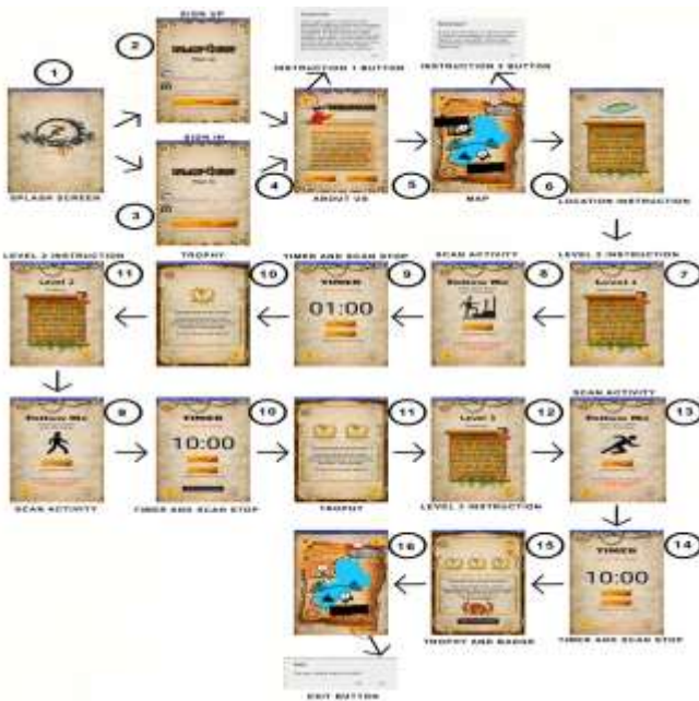
Fig.3. The Play4Fit gameplay

users open the Play4Fit app, a splash screen will appear and subsequently redirect them to registration interface (see Fig. 4 (a) and (b) respectively). Users are required to complete the registration process before able to sign in into the app. After the users sign in into the Play4Fit app, they were given a location map for the health and fitness activities and were asked to choose the location they would like to engage with the fitness activities (see Fig. 5). Only current location will be made available and the other locations were locked (see Fig. 5(a)) and all locations were made available once users completed current activities (see Fig 5(b)). Users will be provided with instruction and were required to follow the instruction and complete the tasks given (see Fig. 6). Users were given time (timer function) to complete the activities and will be rewarded with trophy (gamification element) when completed the activities (see Fig. 7). This process will be repeated until all levels and locations were completed.