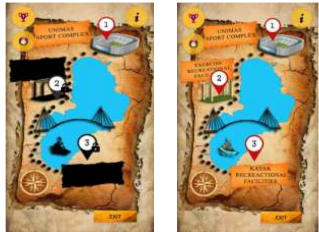
(a) Locked Location (b) Unlocked Location Fig. 5. The initial storyboard of Play4Fit