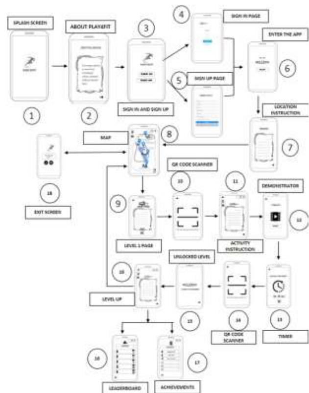
Fig. 2. The complete storyboard and system flow for Play4Fit app

Mobile Application Development Lifecycle (MADLC) was used as a framework for the development of Play4Fit app. It consists of seven main phases: (1) identification, (2) design, (3) development, (4) prototyping, (5) testing, (6) deployment and (7) maintenance phase. This lifecycle aimed to differentiate system development for mobile application [35]. In the first stage, idea and design for health and fitness related smartphone app were collected categorized. The idea from existing app were analyzed and documented particularly the information about health and fitness. Other features of the apps were identified, i.e. health and fitness activities such as jogging, walking, stairs workup. The location for the fitness activities were identified around university campus ranging from jungle park, lake side recreation facilities, kayak recreation facilities and sport complex. Target users for the Play4Fit are University students and their users' requirements were identified in this stage. The aims of this Play4Fit app is to increase users' motivation in health and fitness activities the gamification concept. Thus, promoting healthy lifestyle. The storyboard of the play4Fit app were design based on users' requirement gathered in the first stage. Fig. 1 shows initial storyboard design for the app. Subsequently produce the complete system flow for the app as illustrated in the Fig. 2. The important part in the design stage is creating the overall flow for the Play4Fit app.