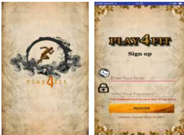
(a) Splash Screen (b) Registration Screen Fig. 4. The splash screen and registration of Play4Fit