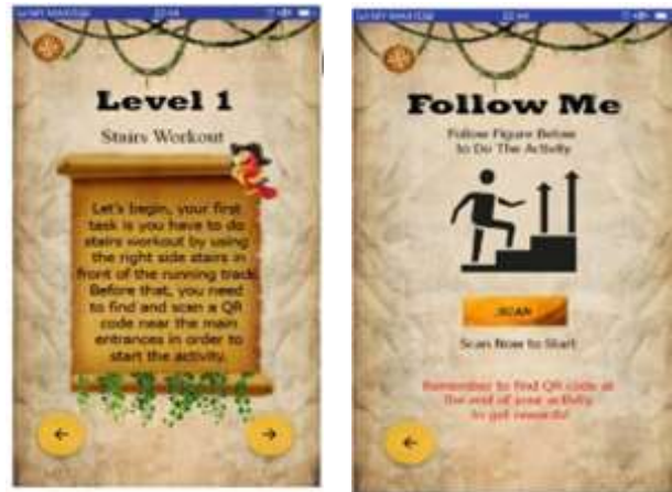
Fig. 6. Activity Instructions