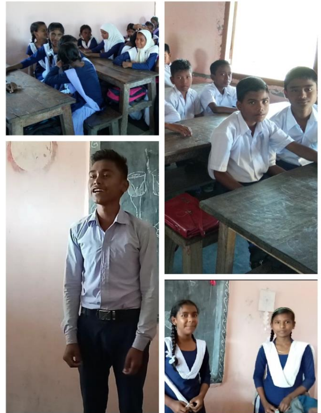
Fig: Students participating in group discussion and presentation