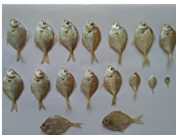
Fig 4. Ponyfishes ( Leiognagthus sp. ) in Suradadi Waters

The result showed that caught of the ponyfishes in Larangan was to 3.186 kg/year/boat and Suradadi was to 5.650 kg/year/boat. The sustainable potential value of Ponyfhis in Larangan is 202,16 kg/year/boat and Suradadi is 111,16