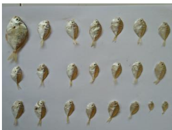
Fig 3. Ponyfishes ( Leiognagthus sp. ) in Larangan Waters