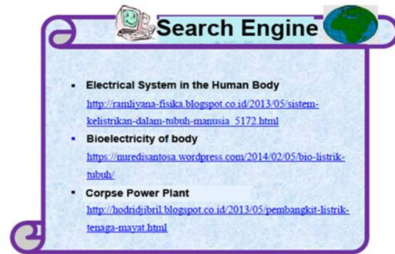
Figure 2. Learning Sites

From Table 4.2 above, the feasibility of this Integrated Basic Biology book, from the aspect of presentation feasibility (technique and construction), has a very feasible category (min = 3.42, sd = 0.238). For all items in the feasibility for this presentation, validators have min values over min of 3.25 to 3.61. There is one point that has a feasible category, namely items related to reflection or feedback. Considering as a whole, the feasibility aspects of the presentation of this book have conceptual harmony, systematic consistency, and student-centeredness, variations in presentation, thematic concept maps, and theoretical summaries. Moreover, there are also thematic concepts of connection, initial knowledge and learning outcomes, case study learning sites, MFI examples, and illustrations that support messages. All items are considered very feasible (very good). The description of the contents of the book can be seen in the pictures below. The description is presented in the Integrated Basic Biology book formed and developed by the researcher and assessed by users; those were the prospective teachers. The overall design in this book can be seen as follows.