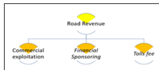
Fig. 1. Road revenues.

Road network maintenance can be achieved by different types of toll stations to cover the costs of damage caused by natural disasters. Three mechanisms for obtaining revenues are commonly used as presented in Tables 2, 3 and 4.