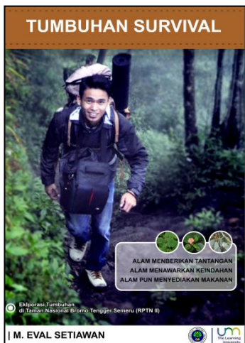
Figure 1 Cover the initial draft

contents of this book, writing the name of the species and the name of the area uses Arial letters with the size 28 and colored need with a transparent black background of measuring 18.46 cm and 3.37 cm with a transparent portion of 35%. In the photo section the collision parts (Leaf / Flower / Stem / Fruit / Root) use photo captions using the Castellar Font with a size of 14 with a rectangular background measuring 4.27 cm length and 0.84 cm width. In the Description part, Habitat and Utilization section use Castellar letters with the size 22 with a blue square background measuring 6.22 cm length and 1.3 cm width. In the bibliography and profile the author uses Times New Roman letters with size 14.