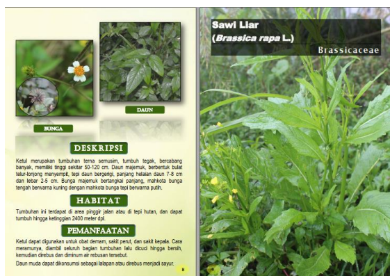
Figure 2 Final cover after revision

In the Foreword section, table of contents, introduction, utilization of survival plants and recognizing survival plants, the writing uses Times New Roman letters with size 14 and bold form with Title in the section using capital letters. In the