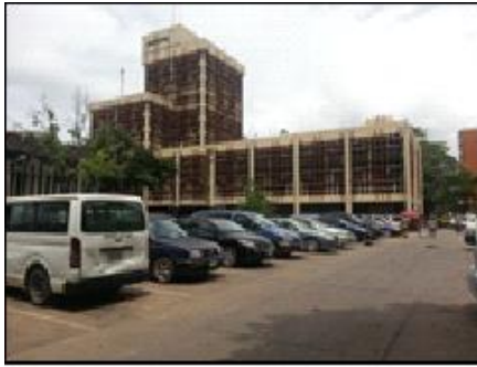
Plate 3 (Plate 1-3: Approach, Left and Rear Views of University of Lagos Senate Building)