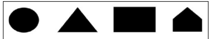
Figure 1: Geometric Shapes (Fussell, 2013)

For papers accepted for publication, it is essential that the electronic version of the manuscript and artwork match the hardcopy exactly! The quality and accu