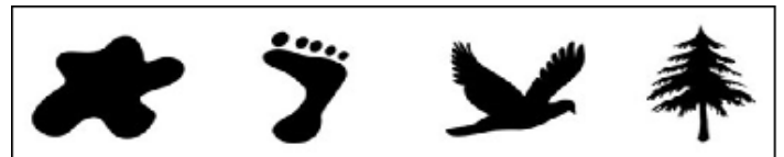
Figure 2: Organic Shapes (Fussell, 2013)

For papers accepted for publication, it is essential that the electronic version of the manuscript and artwork match the hardcopy exactly! The quality and accu