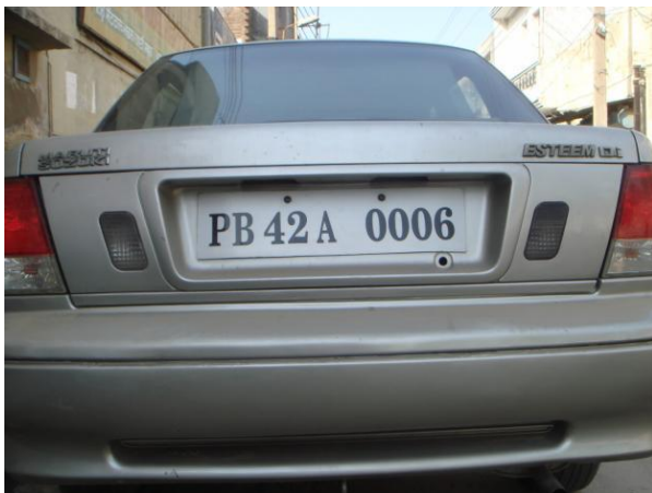
Figure 3. Input Image