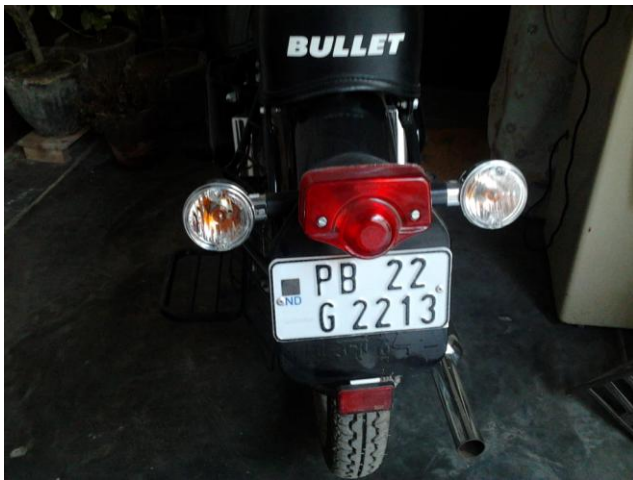
Figure 1. Input Image